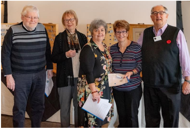
Photo from the November 13 th meeting